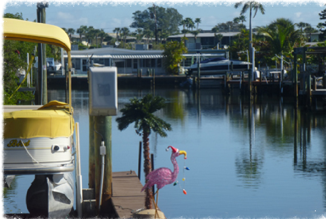
Holidays on the Island