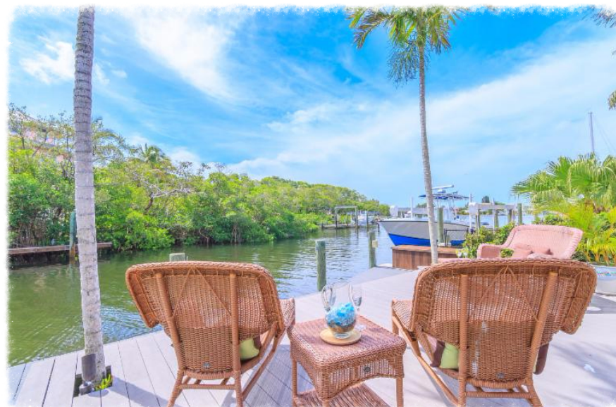
Featured FOR SALE -519 South Dr