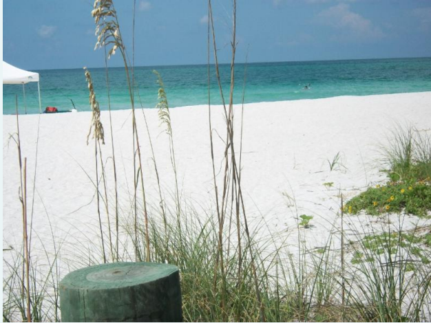
November 2016 Island Sales