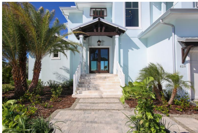
620 Key Royale Dr - 4 bed/ 5 bath ~ $1,999,000