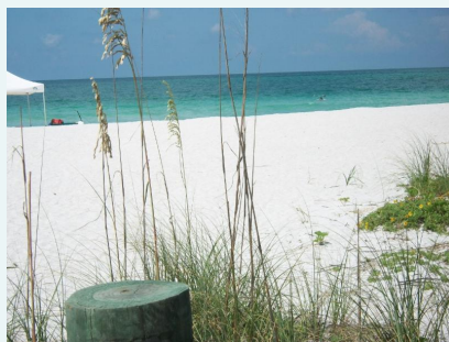
October 2017 Island Sales