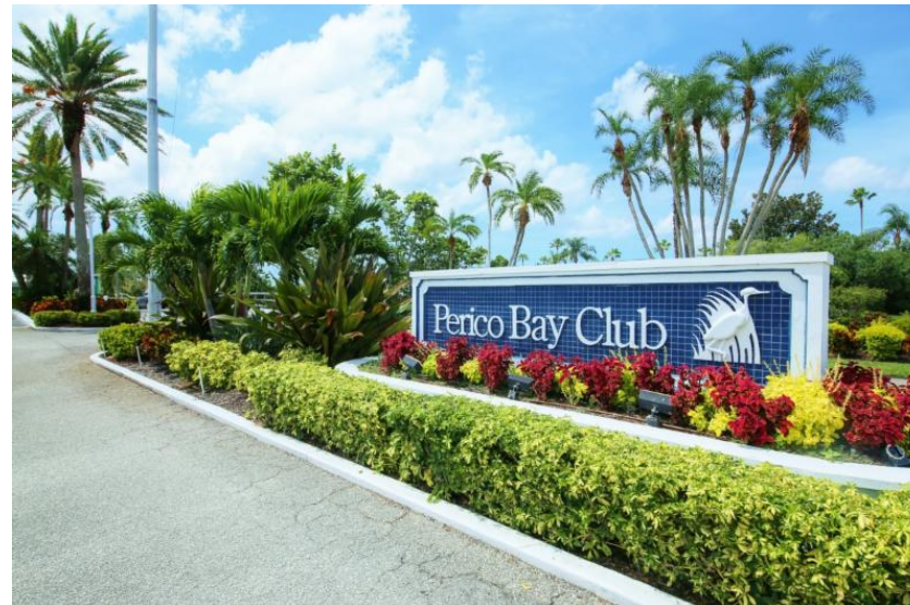
906 Sandpiper Circle ~ 2 bed/2 bath ~$249,000

Loving our services? Don't forget to tell your friends!