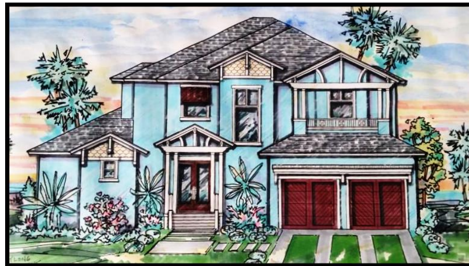
Custom built Key Royale pool home 4 bed/ 5 bath ~ $1,999,000