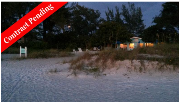
Contract Pending! 4 unit beach resort DIRECT GULF FRONT $1,850,000

Direct Gulf Front property located in the heart of the island! Beautiful views & unlimited potential!