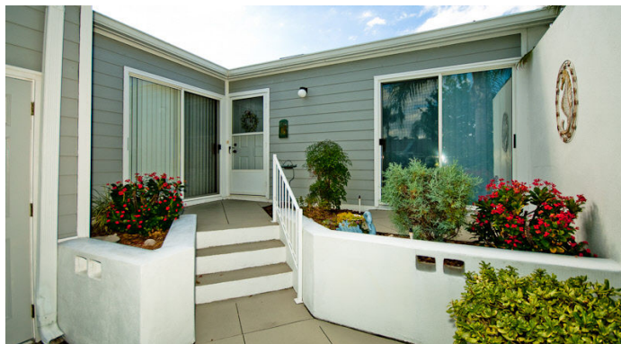
2 bed/ 2 bath Villa Perico Bay Club $230,000