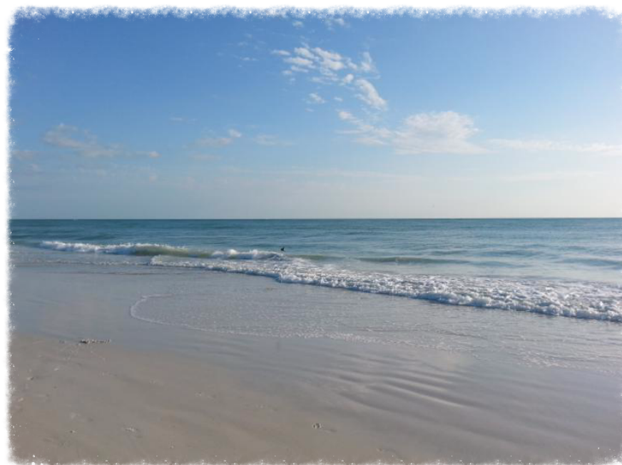
The Island Tides