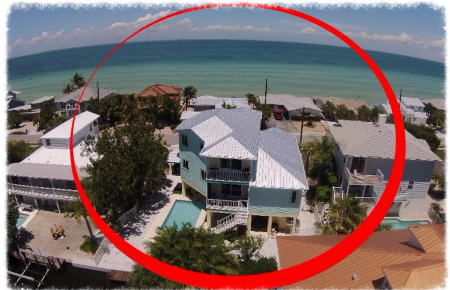
Featured FOR SALE - 505 S Bay, Anna Maria