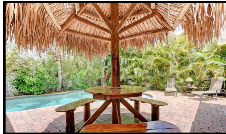
Island Oasis - 3 bed 2 bath $649,000