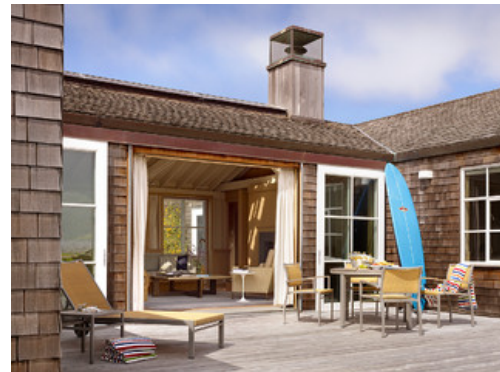
Photo by Butler Armsden Architects - Discover patio design inspiration

Whether you are in the process of fixing up a beach house or dream of owning one, this is chock-full of ideas for fixing up your getaway. Here you'll find products, ideas and color schemes, from outdoor showers and wraparound decks to paint colors inspired by the sand and sea.