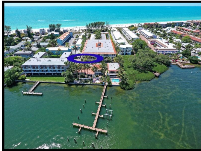
Tortuga Inn 164 - 2 bed/ 2 bath ~ $489,000