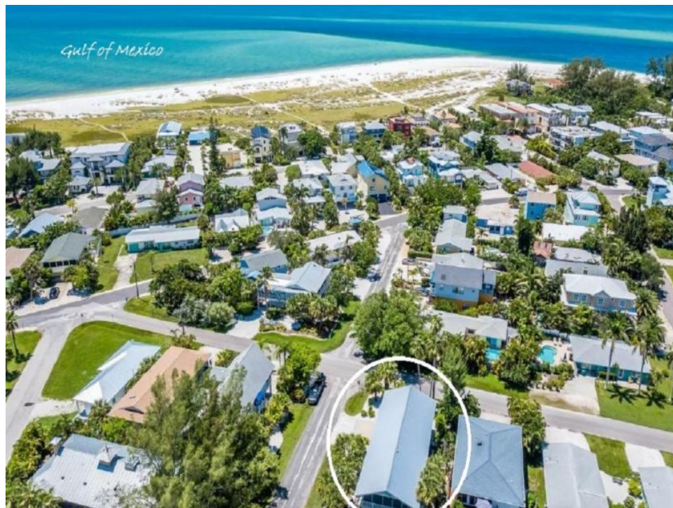
620 Rose Street, Anna Maria FL 34216

Loving our services? Don't forget to tell your friends!